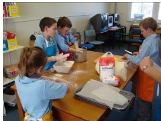
Open Day Lunch and Marble Run