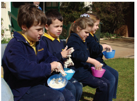
Aboriginal Education Day