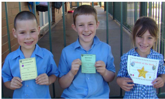
Chloe absent in photo.