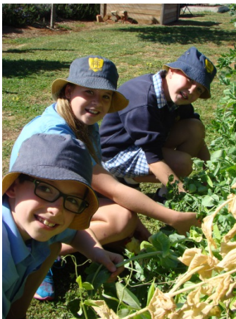
Corowa Community Garden