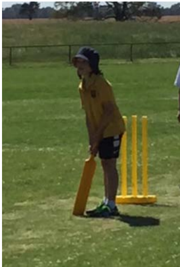
Super 8's Cricket